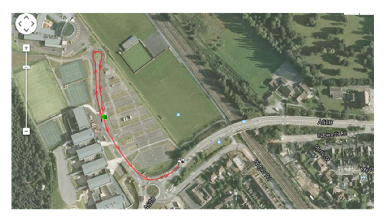
HALF MARATHON FINISH - RETFORD HALF MARATHON 2020